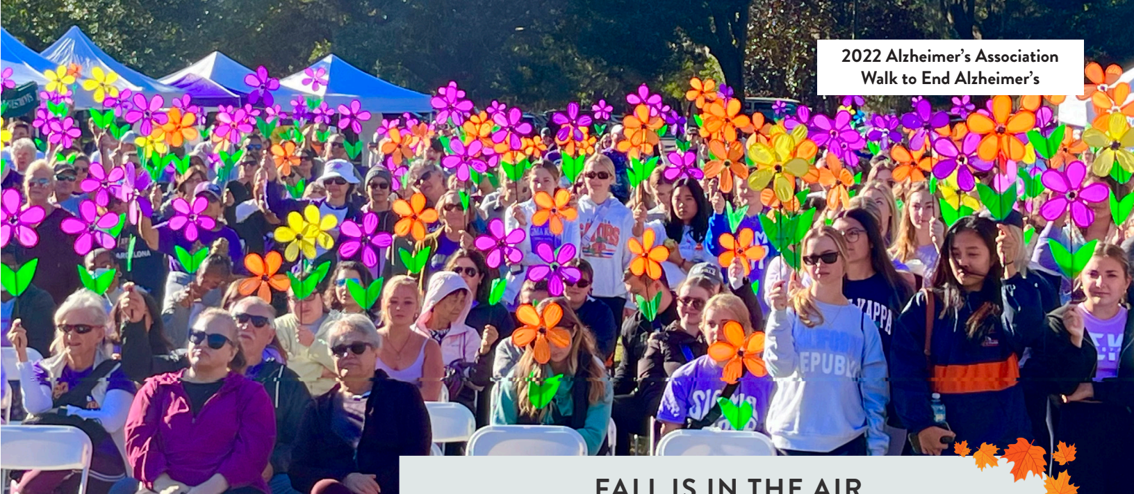
2022 Alzheimer's Association Walk to End Alzheimer's

Phone: (352) 373-8000 | www.meldonlaw.com | Help@meldonlaw.com | Contact us 24/7 for a Free Consultation—We Deliver Because We Won't Back Down