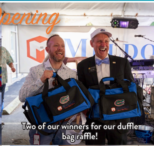
Two of our winners for our duffel bag raffle!