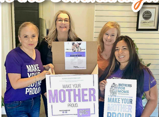
Another year of supporting the Movers for Moms campaign