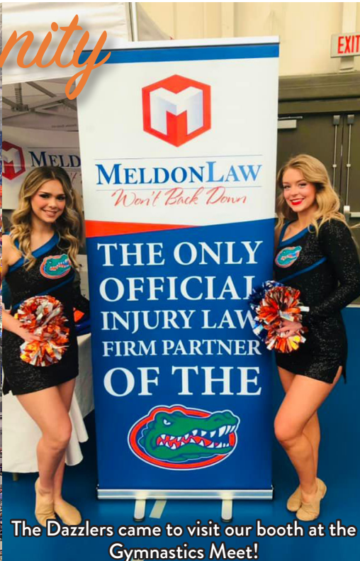
The Dazzlers came to visit our booth at the Gymnastics Meet!