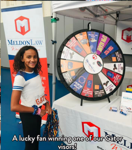
A lucky fan winning one of our Gator visitors!