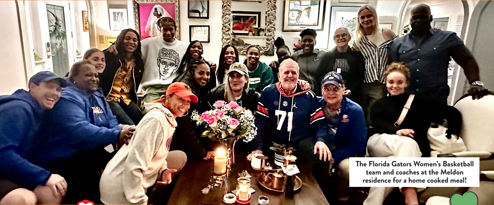
The Florida Gators Women's Basketball team and coaches at the Meldon residence for a home cooked meal!

Phone: (352) 373-8000 | www.meldonlaw.com | Help@meldonlaw.com | Contact us 24/7 for a Free Consultation—We Deliver Because We Won't Back Down