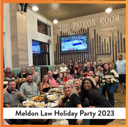
Meldon Law Holiday Party 2023