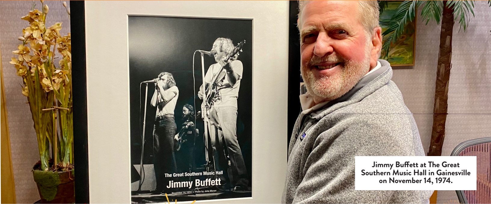
Jimmy Buffett at The Great Southern Music Hall in Gainesville on November 14, 1974.

Phone: (352) 373-8000 | www.meldonlaw.com | Help@meldonlaw.com | Contact us 24/7 for a Free Consultation—We Deliver Because We Won't Back Down