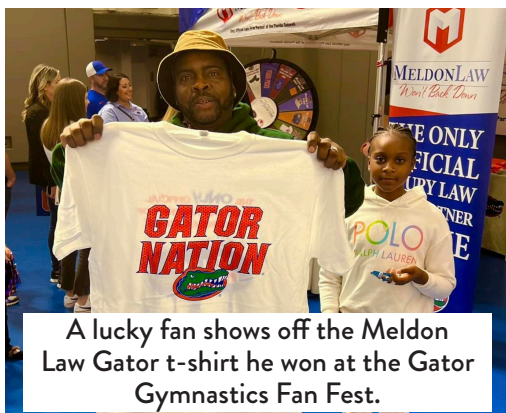
A lucky fan shows off the Meldon Law Gator t-shirt he won at the Gator Gymnastics Fan Fest.