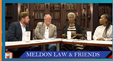
Follow our Podcast