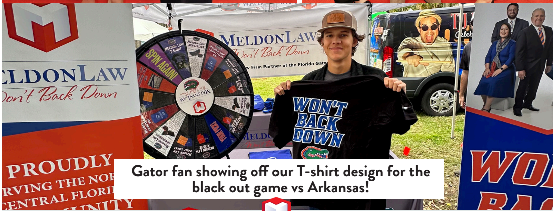
Gator fan showing off our T-shirt design for the black out game vs Arkansas!