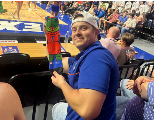
A Gator fan who won a pair of Albert and Alberta socks, sponsored by Meldon Law.