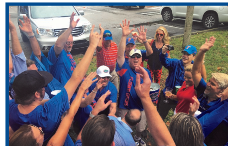
Legendary Ceremonial Toast Prior to the Homecoming Game