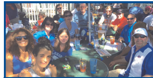
24th Annual Meldon Law Party on the front lawn of The Swamp Restaurant prior to the Homecoming Parade