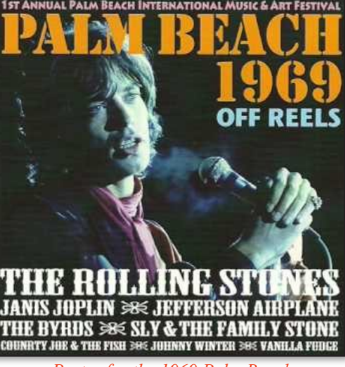
Poster for the 1969 Palm Beach Music Festival

Who would have ever thought that Rock 'n Roll bands would be at the height of their drawing power when all the band members were in their 70's. We all thought Roll 'n Roll was for only for those in their 20's or maybe 30's but after that our favorite artists would have to fade away into oblivion. Not true! And here was the perfect example of the group that stayed the biggest for the longest and proved us all wrong..."Hail Hail Rock 'n Roll" and to my favorite group of all time: The Rolling Stones.