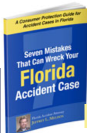
Consumer Protection Accident Guide Book