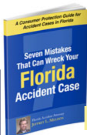
Consumer Protection Accident Guide Book