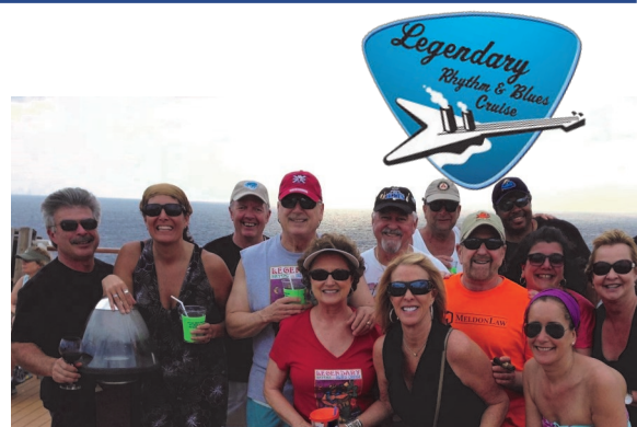
"It's all about the crew at the back of the boat"