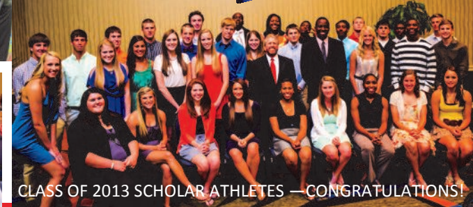
CLASS OF 2013 SCHOLAR ATHLETES — CONGRATULATIONS!