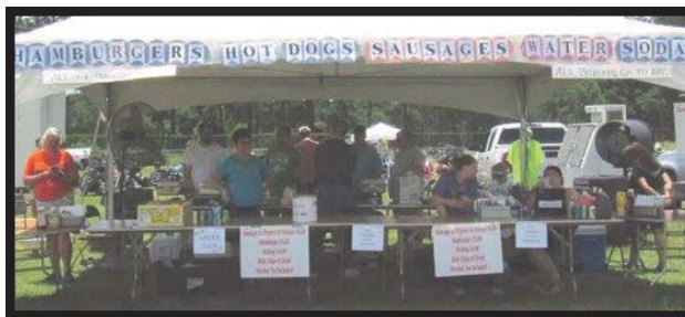
ARC set up a food tent where all proceeds went to The ARC of Marion.