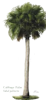
Cabbage Palm Sabal palmetto