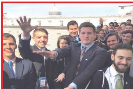
Gators for Israel on Ted Yoho's porch outside his office with the U.S. Capitol building under construction in the background.