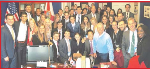
The Gators for Israel student delegation to the AIPAC policy conference at the office of Ted Yoho asking for his support of Israel.